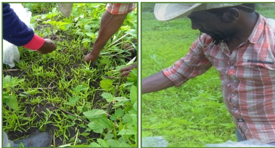
Figure 2. Pictures depicting data collection on weed species composition and quantitative measures at Qafta Humera in sesame field during the survey in 2018.

sedges. Data analysis from the weed survey showed that the most frequent species that were accounted for more than 30% frequency values were: Cyanotis sp (34.67%), Cyperus rotundus (37.14%), Digitaria sanguinalis (35.72%), Medicago denticulata (57.14%), Oplismenus burmannii (30.37%), and Vicia sativa (32.39%) (Tables 3, 4 and 5).